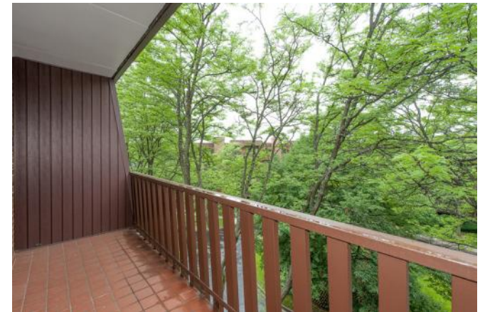
Tiled Balcony with tree top views extends from Kitchen Eating Area to FamilyRm/Den