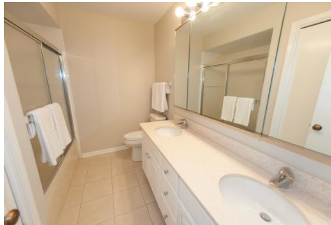
Master bath with double vanities