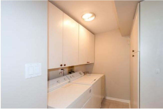
Laundry Room w/ free standing washer & dryer & cabinetry