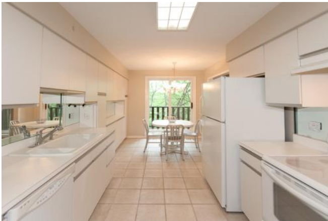
Light, Airy Kitchen fully equipped w/ plenty of cabinetry & sunny Eating Area