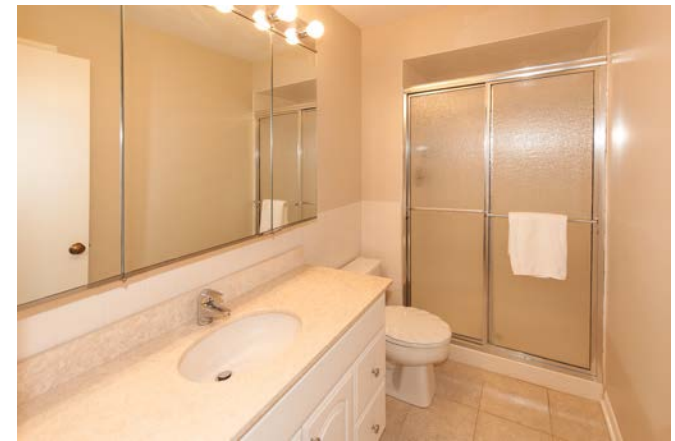
Second Bath/Hall Bath