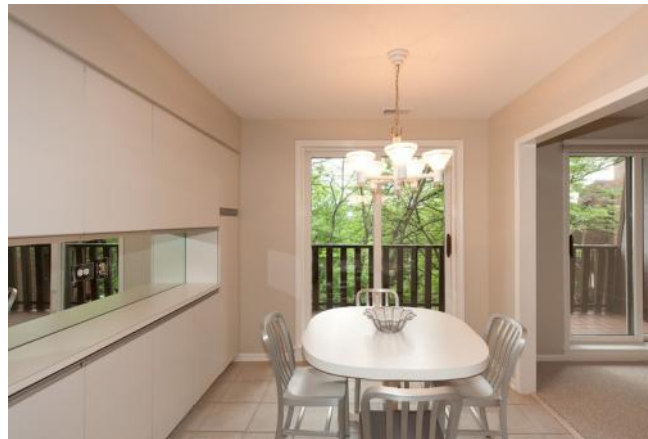
Good size Eating Area w/ access to tiled Balcony