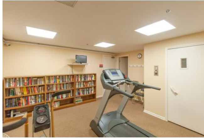
exercise room with...