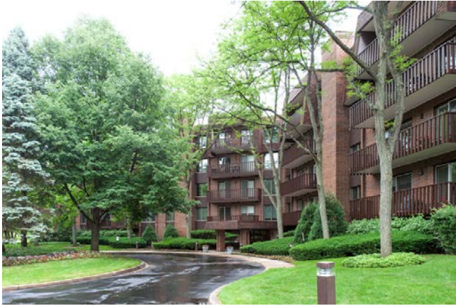
Sunny top floor 2 bedroom, 2 bath condominium with open floor plan