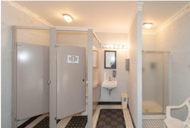
pool changing room...