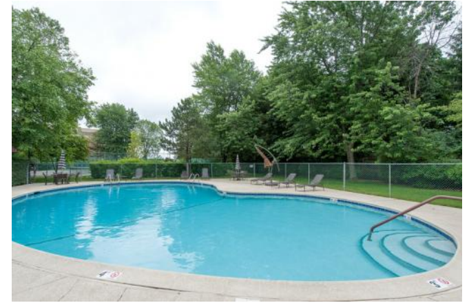
amenities include pool...