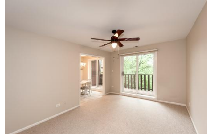
Another view of Family Room/Den w/ access to tiled Balcony w/ tree top views