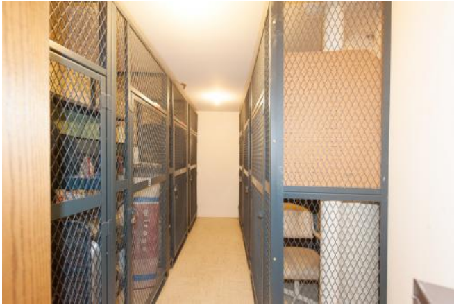
same floor storage...