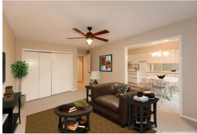
Digitally Staged Family Room/Den