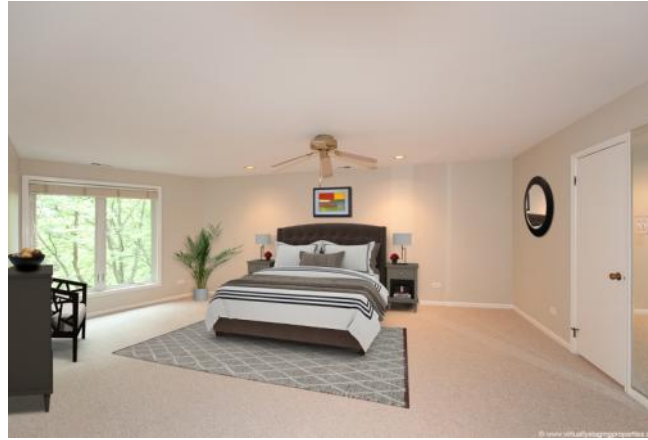
Digitally Staged Master Bedroom