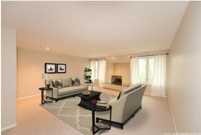
Digitally Staged Living Room