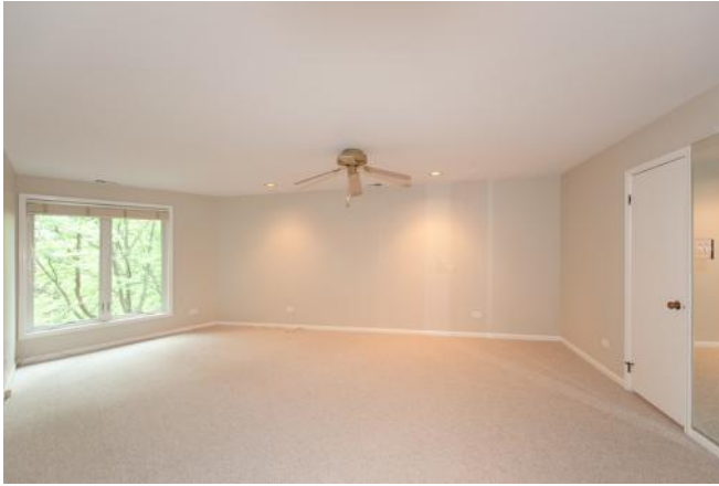
Master bedroom with 2 walk-in closets