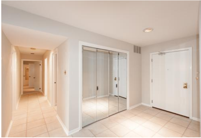
Freshly painted and newly carpeted. Large front closet in tiled foyer.