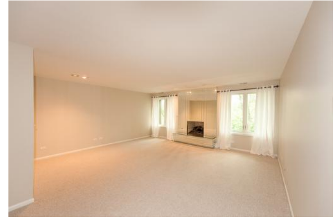
Spacious Living Room with perfectly placed fireplace (gas starter, gas logs) flanked by floor to ceiling windows