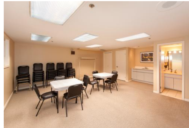
Party/Meeting Rm w/Bathroom