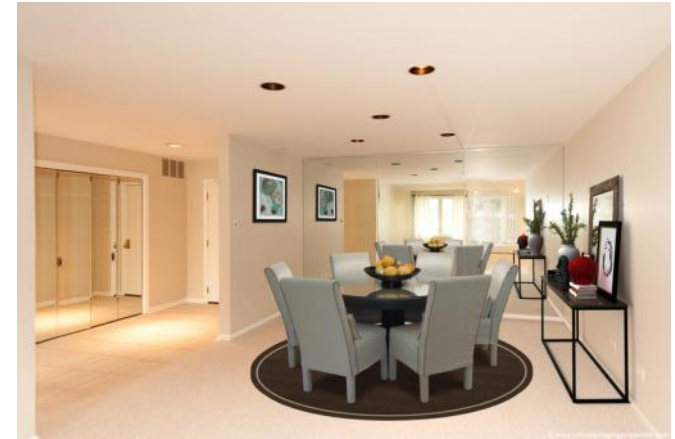
Digitally Staged Dining Room