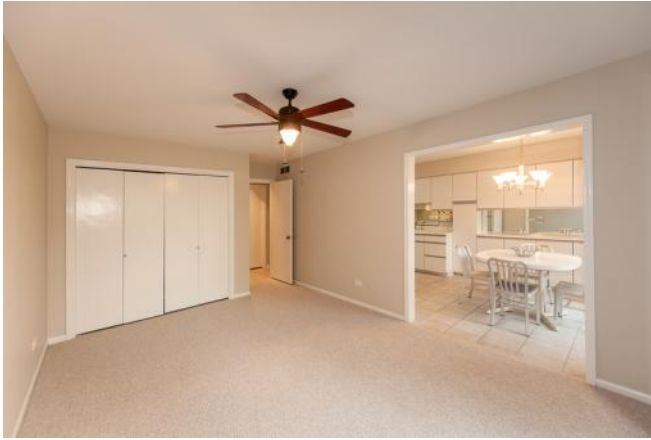
Family room/den off of open kitchen eating area