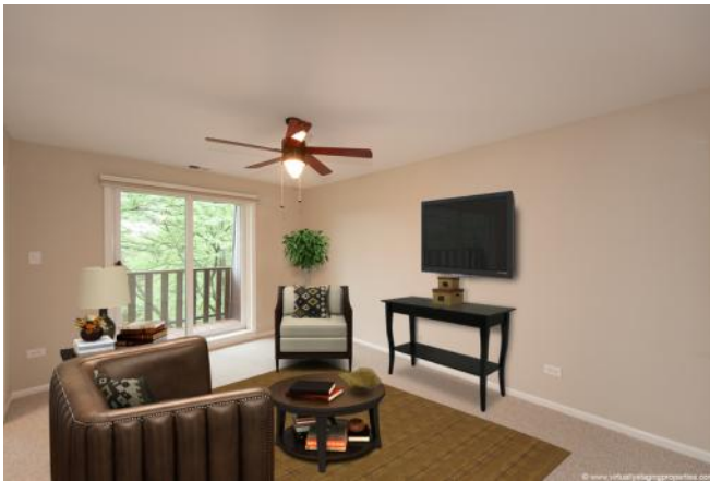
Another Digitally Staged view of Family Room/Den