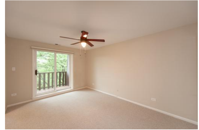
Another view of Family Rm/Den off of Kitchen Eating Area