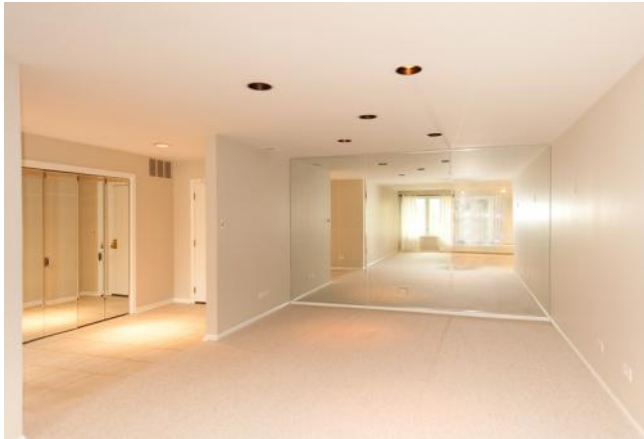
Large formal dining room off living room - all with recessed lighting